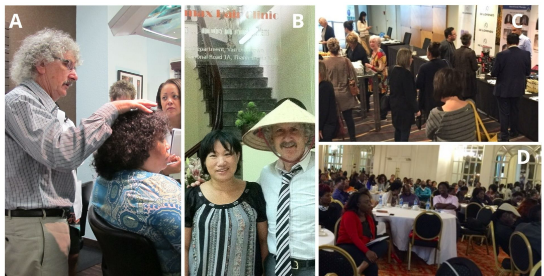
Image 3: A- Training in USA. B- Training in Viet Nam. C- New Zealand Conference. D - Nairobi Conference

In the late 70s, IAT started enrolling students from Australia and New Zealand and aided by cheap air fares to Australia, David flew to Australia; the outcome was that several colleges started teaching the trichology course and IAT conducted clinical training and seminars in both Australia and New Zealand.