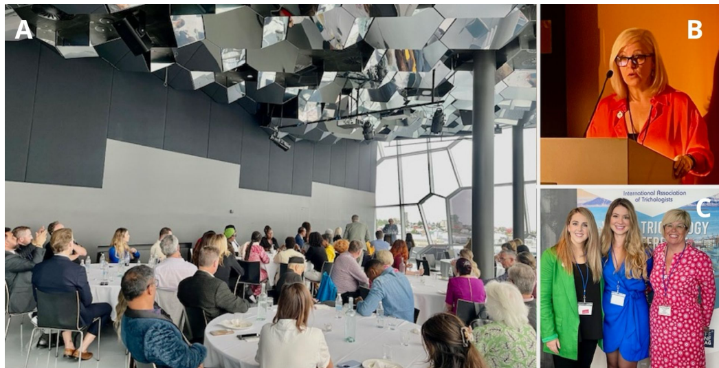
Image 4: A- Iceland 50th Anniversary Celebration. B and C - Iceland 50th Anniversary Conference

When training students in South Korea, IAT discovered that an organization there had copied our entire course, despite the fact it was copyrighted ! We took them to court and won.