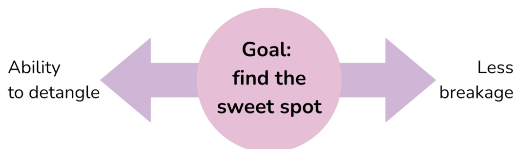
Figure 1: The solution needs to balance Detangling and Less Breakage

Mechanical breakage plays a central role in this scenario. Brushing hair with the wrong tool can worsen hair loss — especially in vulnerable situations such as postpartum, menopause, excessive heat styling, chemical straightening, bleaching, or protective hairstyles. It is estimated that a person loses 50 to 100 hairs per day. In fragile hair, that number can increase dramatically. That’s why choosing the right brush should be part of a damage-prevention and self-care strategy (Figure 1).